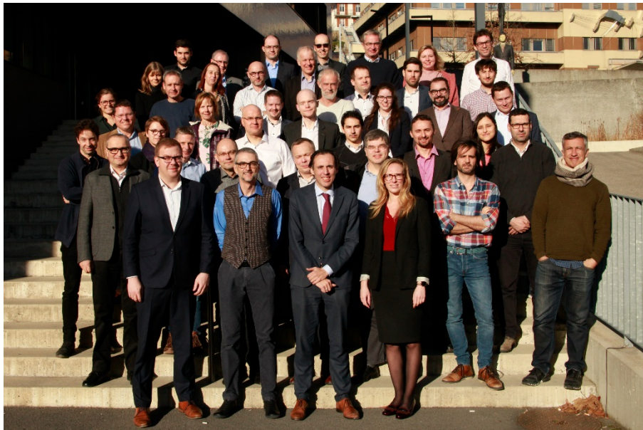
Kick off meeting PHABULOuS EU Project in Neuchatel 15-16/01/2020

PHABULOuS has received funding in the order of 15 Mio. EUR in the framework of the Horizon 2020 Work Programme.