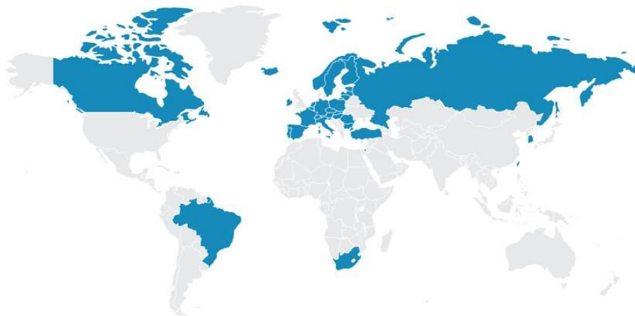
Figure 1: M-ERA.NET participants, see also

M-ERA.NET started in 2012 under the FP7 scheme and continues from 2016 to 2021 under the Horizon 2020 scheme as a network of more than 40 public funding organisations from around 30 different countries, including national, regional and non-European organisations. M-ERA.NET aims to identify further relevant materials research programmes and to establish cooperation with funding organisations from Europe and beyond.