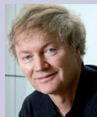
Prof. Dr. Michael Graetzel Head of Laboratory of Photonics and Interfaces, EPFL Lausanne